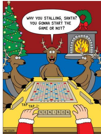
WHY YOU STALLING, SANTA? YOU GONNA START THE GAME OR NOT?