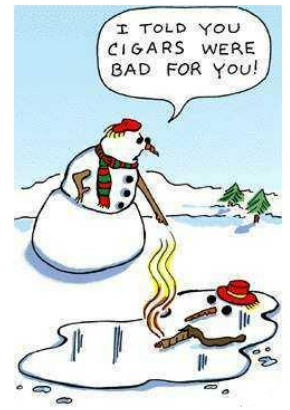
I TOLD YOU CIGARS WERE BAD FOR YOU!