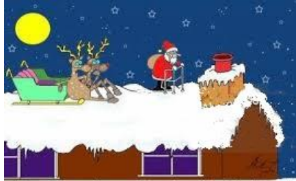
"Every year, he gets just that little bit slower."

Wow – another year is almost done and dusted – they seem to go faster each year. Trust that, if you get together with family and friends, you have a positive and memorable time.