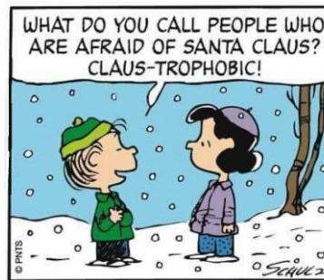
WHAT DO YOU CALL PEOPLE WHO ARE AFRAID OF SANTA CLAUS? CLAU-TROPHOBIC!