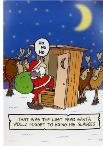
Ho Ho Ho